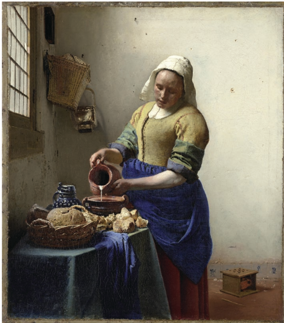
Johannes Vermeer, The Milkmaid , circa 1658.